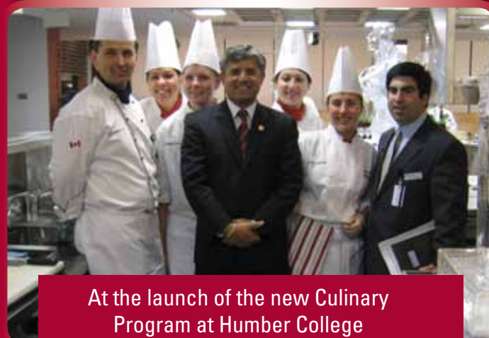
At the launch of the new Culinary Program at Humber College