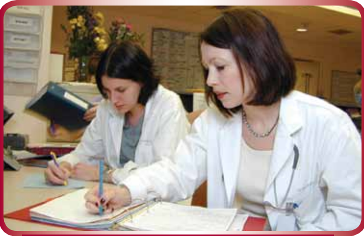
Stronger Nursing programs at Humber College

Eighteen, third-year nursing students from Humber College Institute of Technology and Advanced Learning received a first-hand experience with community nursing this academic year.