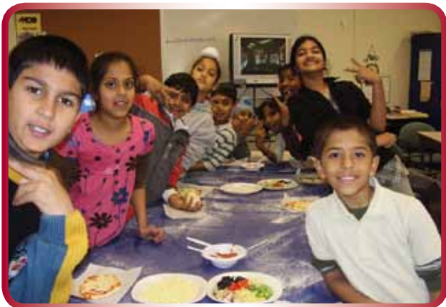
With kids at a Community Breakfast Program

www.homeenergyontario.ca • 1-888-668-4636 • www.gov.on.ca