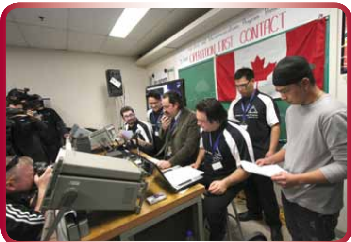
Congratulating the Humber College students on contacting the Space Station

Operation First Contact had just a 10-minute window to find the ISS’s signal and speak to the astronaut before it hurtled out of range at nearly 27,000 km/hour.