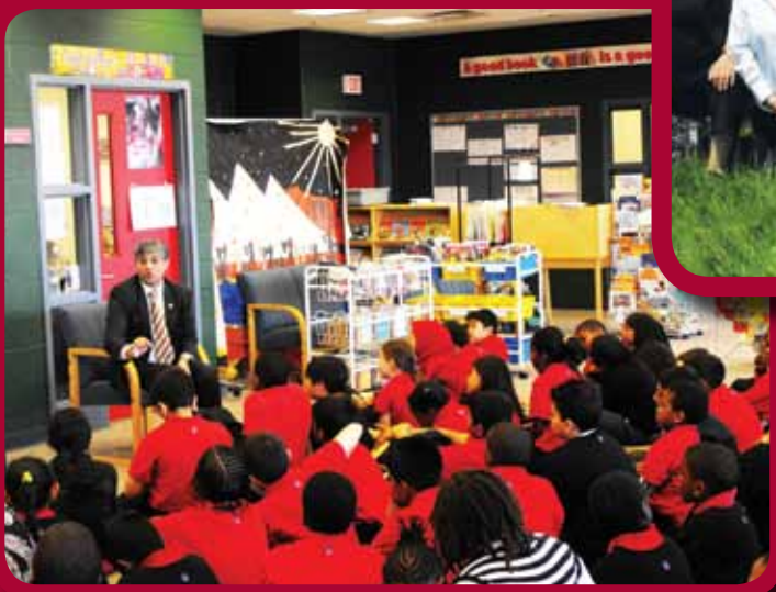
Career Day at North Kipling Junior Middle School. ↑