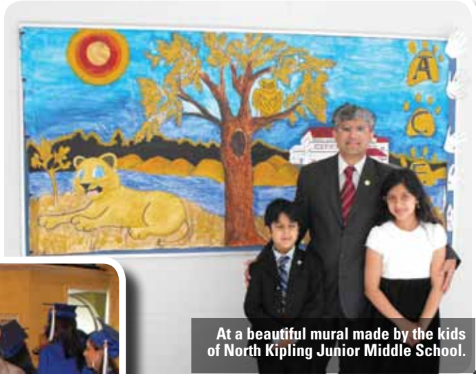
At a beautiful mural made by the kids of North Kipling Junior Middle School.

The Ontario government's goal is to have 75% of students achieving scores at or above the provincial standard of a 'B' or higher. These assessments help teachers, principals and school board administrators identify when students and student groups need additional academic help.