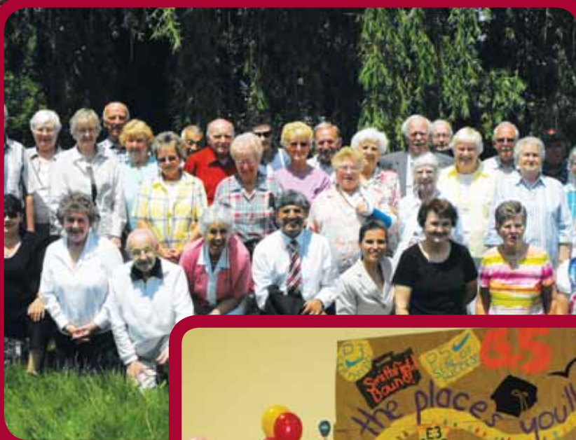
Volunteer Appreciation at the West Acres Seniors Recreation Centre. →